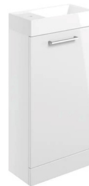
VOLTA CLOAKROOM BASIN