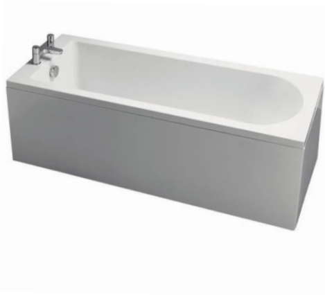
BATH WITH HINGED BATH SCREEN